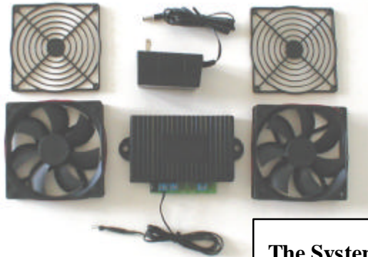
The System 2 Kit