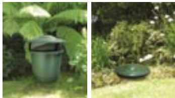
For enhanced bass performance, add the unique Terra AC.SUB, designed for installation above or partially below ground and a perfect complement to your AC Series loudspeakers.

Hand-built in Maine, Terra AC Series speakers are designed to last, which is why they come with a limited lifetime warranty. Just as you consider quality landscaping an integral part of your outdoor lifestyle, consider advanced "soundscaping" with Terra AC Series speakers. You'll multiply your enjoyment of every outdoor moment, for years to come.